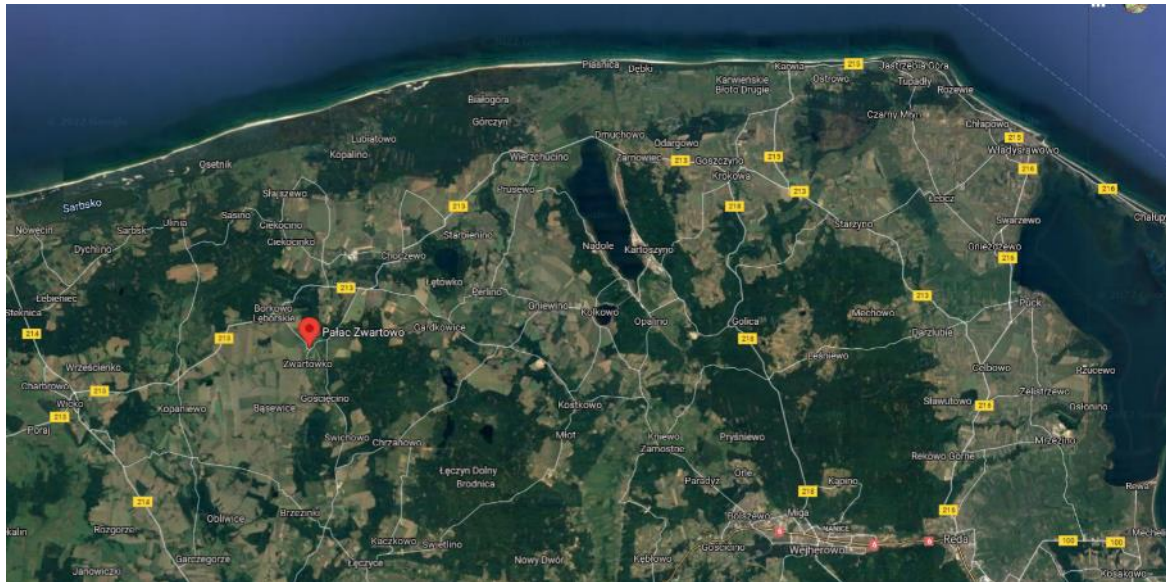
Figure 1 Location of the Zwartowo photovoltaic farm in Poland

The site is located in Zwartowo, Choczewo Commune, Northern Poland. The site is found ca. 4 km away from planned location of first Polish Nuclear Power Plant