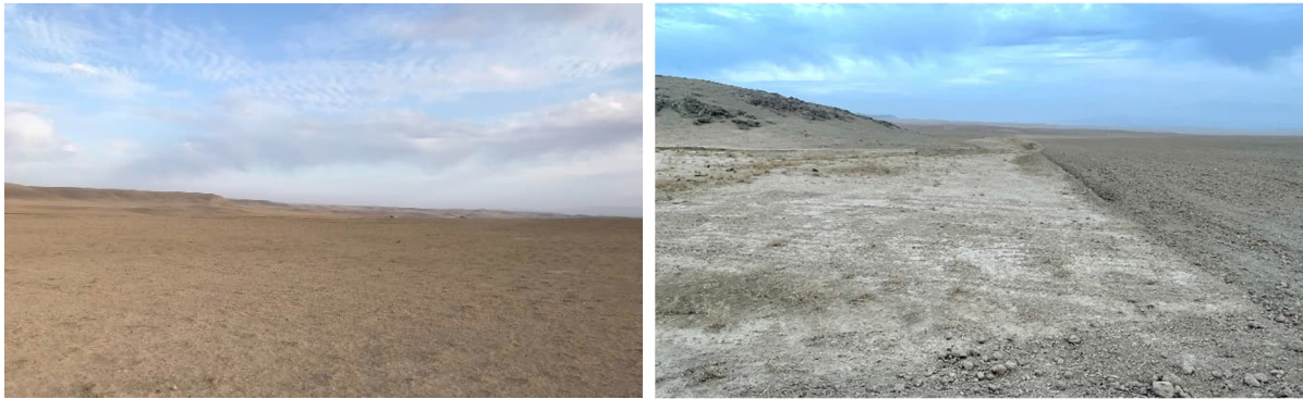
Figure 2: Project Site Area (left) and Route of Overhead Line (right)