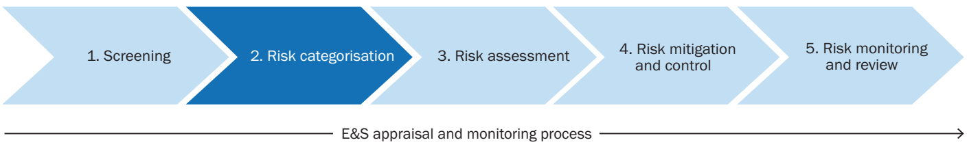
Figure 1. Risk categorisation stage of sub-projects

The EBRD recommends that FIs use a three-tier categorisation system such as the one below: